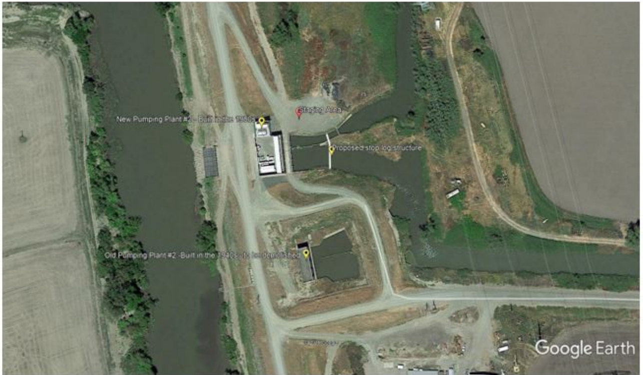
3) Approximate project footprint map (Pumping Plant 2)